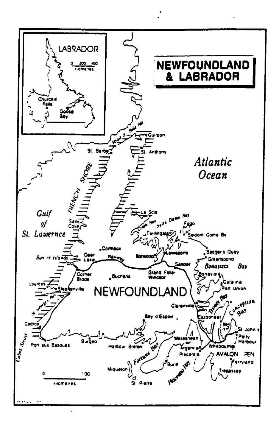
Figure 1: Map of Newfoundland Showing the Railway Line